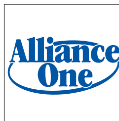
ATM DECAL Item No. 4320

Size 4" x 4", weather resistant $5.45/each